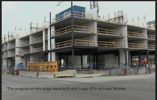
*The projects on this page were built with Logix ICFs by Logix Brands

© Copyright Logix Brands Ltd. (2023) All rights reserved.